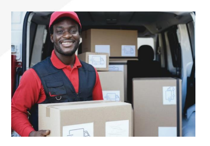
Parcels – 3.73 million

The trend is not unique to Kenya but global as the volume of global letter-post has continued to decline in contrast with the rise in traffic of small packets.