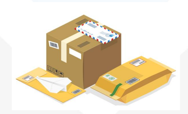
Letters - 1.27million

The trend is not unique to Kenya but global as the volume of global letter-post has continued to decline in contrast with the rise in traffic of small packets.